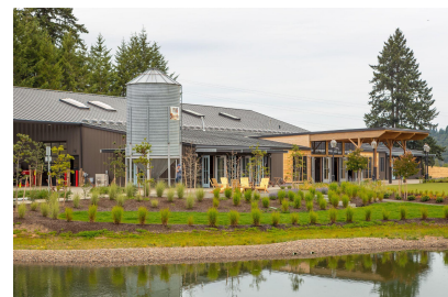
Abbey Road Farm

CARLTON, Ore. (Feb. 17, 2023) – Abbey Road Farm , the 82-acre farm in the heart of the Willamette Valley, is excited to welcome guests to experience its inaugural Hitched Wedding Showcase, with two session options from 11 a.m. - 2 p.m. or 2:30 - 5:30 p.m. on Saturday, March 4.